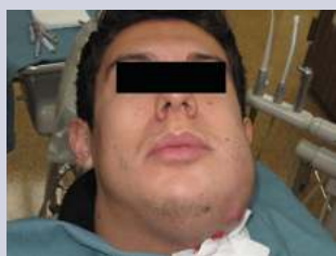
Fig. 4. Acute apical abscess with extraoral diffuse facial cellulitis.

antibiotic therapy is not routinely indicated, depending on the patient's general medical status. However, when the patient presents with diffuse facial swelling (cellulitis) resulting from an acute apical abscess or an infection with systemic involvement (fever or malaise) (Figure 4), debridement of the pulp space with placement of calcium hydroxide, surgical incision for drainage, when possible, and an appropriate regimen of systemic antibiotics (oral or IV) are the treatments of choice.