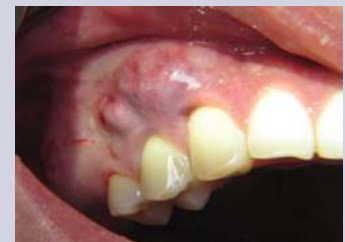
Fig. 3. Acute apical abscess with intraoral localized swelling.