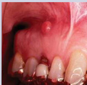
Fig. 2. Chronic apical abscess.

An acute apical abscess usually presents with rapid onset, spontaneous pain and swelling, both localized and intraoral, sometimes with exudate present, or with diffuse facial cellulitis. When the abscess is intraoral and localized (Figure 3), debridement of the pulp space and placement of calcium hydroxide and surgical incision for drainage is usually sufficient to resolve the problem. Systemic