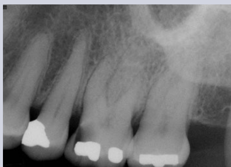
Fig. 3. Maxillary left first molar has occlusal-mesial caries and the patient has been complaining of sensitivity to sweets and to cold liquids. There is no discomfort to biting or percussion. The tooth is hyper-responsive to Endo-Ice® with no lingering pain. Diagnosis: reversible pulpitis; normal apical tissues. Treatment would be excavation of the caries followed by placement of a permanent restoration. If the pulp is exposed, treatment would be non-surgical endodontic treatment followed by a permanent restoration such as a crown.