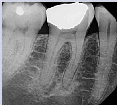
Fig. 1. Mandibular right first molar had been hypersensitive to cold and sweets over the past few months but the symptoms have subsided. Now there is no response to thermal testing and there is tenderness to biting and pain to percussion. Radiographically, there are diffuse radiopacities around the root apices. Diagnosis: Pulp necrosis; symptomatic apical periodontitis with condensing osteitis. Non-surgical endodontic treatment is indicated followed by a build-up and crown. Over time the condensing osteitis should regress partially or totally (15).